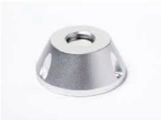
SKU : E80002

It is universally compatible with magnetic locking EAS devices and is extra strength for easy removal of security device.