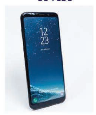
SAMSUNG GALAXY S8 PLUS