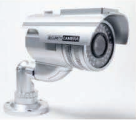
SKU : E50013

Ideal for home owners, property owners and business owners.