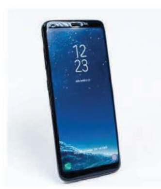
SAMSUNG GALAXY S8