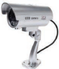
SKU : E50012

Ideal for home owners, property owners and business owners.