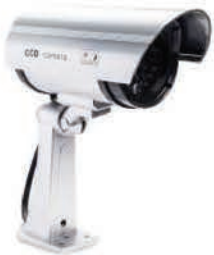
SKU : E50014

Ideal for home owners, property owners and business owners.