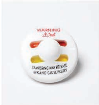
SKU : E30006 Dimensions : 25mm Diameter Frequency : 8.2Mhz