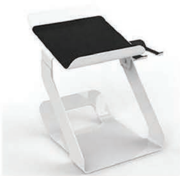
SKU: E40013 Printer Size: 5.7 x 6.1 x 6.0"

The stand is ideal for use in small businesses, bars, restaurants, kiosks, schools, retail, offices, hotels, hospitals, and even special events/trade shows.