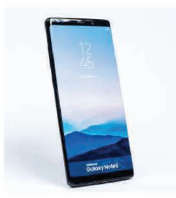
SAMSUNG GALAXY NOTE 8