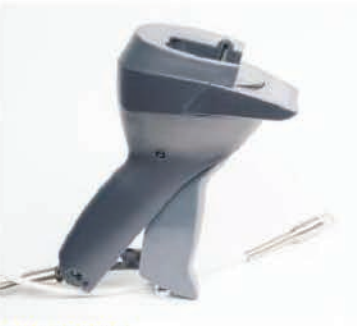
SKU: 90038 Dimensions: 11.02 x 5.12 x 3.15" Weight: 0.77 lb.

The Hand Pin-Detacher allows users to detach hard tags from any product. It is portable and easy to transport.