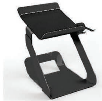
SKU: E40023 Printer Size: 5.7 x 6.1 x 6.0"