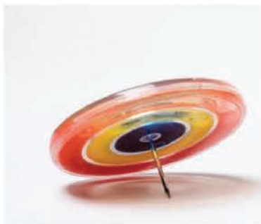
SKU : E30007 Dimensions : 25mm Diameter

An alarm will sound if it passes through an RF reader. The pin gets inserted into the hard tag to secure product (included) and the forced removal of pin will result in ink expulsion. It is easy to apply and remove and is easily reusable.