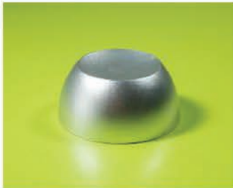
SKU : E80001

It is compatible with low magnetic locking EAS devices such as stoplocks.