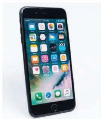
IPHONE 7 PLUS