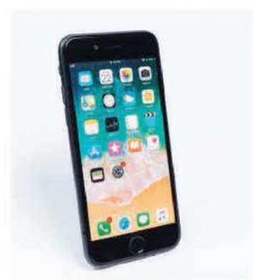
IPHONE 8 PLUS