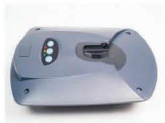
SKU : E90039

It is universally compatible with magnetic locking EAS devices.