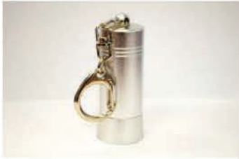
SKU : E80003