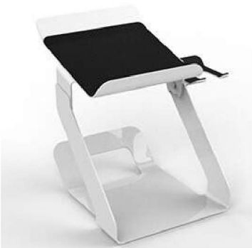
SKU: E40013 Printer Size: 5.7 x 6.1 x 6.0"

The stand is ideal for use in small businesses, bars, restaurants, kiosks, schools, retail, offices, hotels, hospitals, and even special events/trade shows.