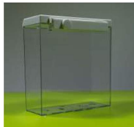
SINGLE DVD SAFER BOX $1.45

SKU: E20005 Dimensions: 7.60 x 5.79 x 1.30" Frequency: 8.2MHz