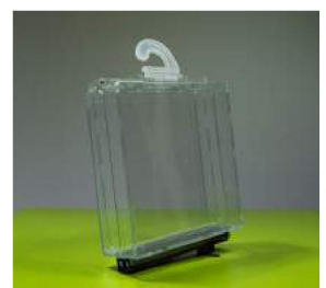
RAZOR SAFER BOX $1.40

SKU: E20006 Dimensions: 4.72 x 4.33 x 1.18" Frequency: 8.2MHz