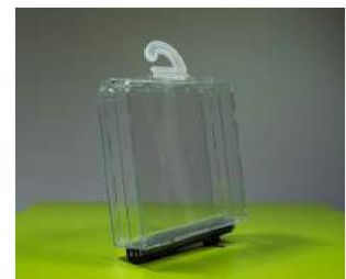
UNIVERSAL SMALL SAFER BOX $1.45

SKU: E20008 Dimensions: 4.72 x 4.33 x 1.57" Frequency: 8.2MHz