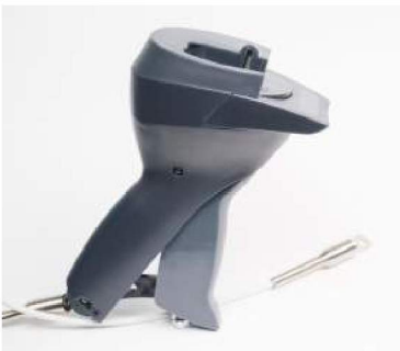
SKU: 90038 Dimensions: 11.02 x 5.12 x 3.15" Weight: 0.77 lb.

The Hand Pin-Detacher allows users to detach hard tags from any product. It is portable and easy to transport.