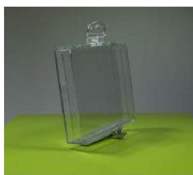
DOUBLE CD SAFER BOX $1.45

SKU: E30010 Dimensions: 48 x 42 x 19mm Frequency: 8.2MHz