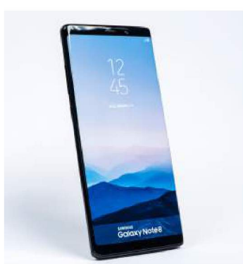
SAMSUNG GALAXY NOTE 8