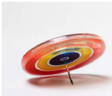
SKU : E30007 Dimensions : 25mm Diameter

An alarm will sound if it passes through an RF reader. The pin gets inserted into the hard tag to secure product (included) and the forced removal of pin will result in ink expulsion. It is easy to apply and remove and is easily reusable.