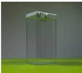
COSMETIC SAFER $1.90

SKU: E20001 Dimensions: 5.5 x 2.87 x 2.05" Frequency: 8.2MHz