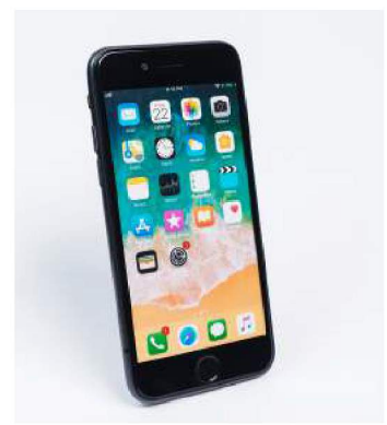
IPHONE 8 PLUS