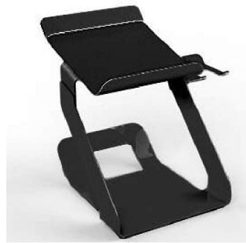
SKU: E40023 Printer Size: 5.7 x 6.1 x 6.0"