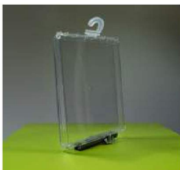
INK CARTRIDGE SAFER BOX $1.90

SKU: E20004 Dimensions: 5 x 1.96 x 4.92" Frequency: 8.2MHz