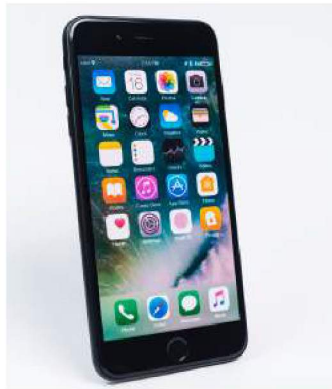
IPHONE 7 PLUS