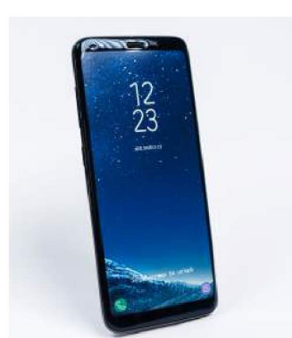
SAMSUNG GALAXY S8