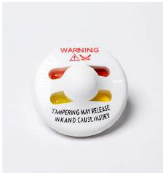
SKU : E30006 Dimensions : 25mm Diameter Frequency : 8.2Mhz