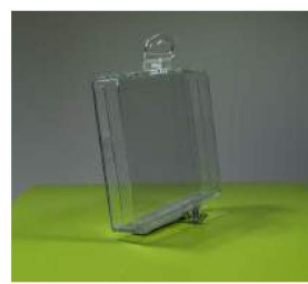
HARD DRIVE SAFER BOX $1.75

SKU: E20003 Dimensions: 6.34 x 5.95 x 1.58" Frequency: 8.2MHz