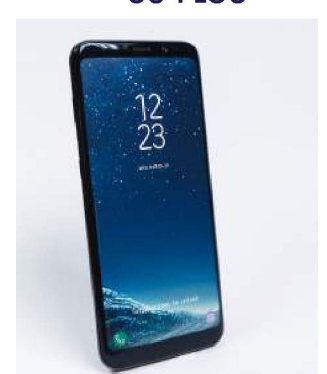
SAMSUNG GALAXY S8 PLUS